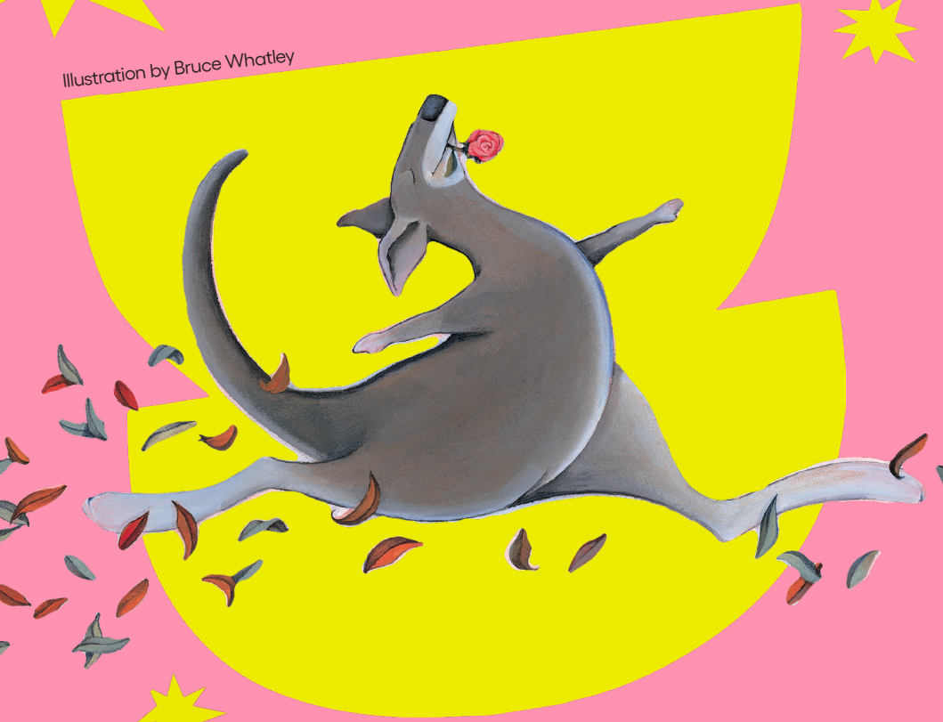
Illustration by Bruce Whatley